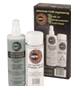
Restore Kits 90-50001 Blue Aerosol 90-50501 Blue Squeeze